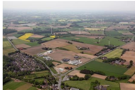
Luftbildansicht Gewerbegebiet Holtwick