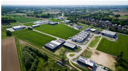
Luftbildansicht Gewerbegebiet Holtwick