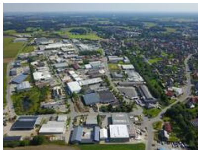
Industriegebiet 170828 (18).JPG