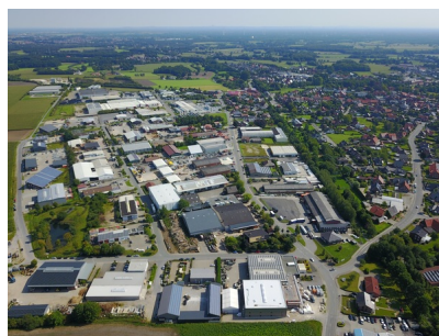
Industriegebiet 170828 (18).JPG