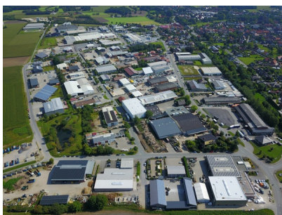
Industriegebiet 170828 (17).JPG