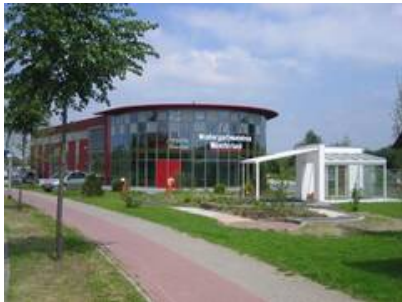
Einfahrtsituation Gewerbeparks Kiebitzpohl.JPG