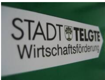
Wir freuen uns über Ihren Anruf 02504 13298.JPG