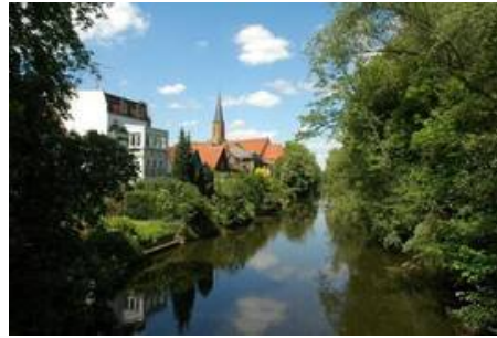
Lebenswerte Stadt - Emsblick.JPG