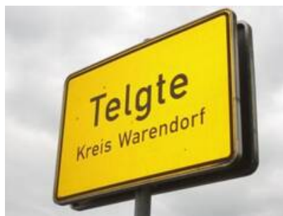
Telgte im Kreis Warendorf.JPG