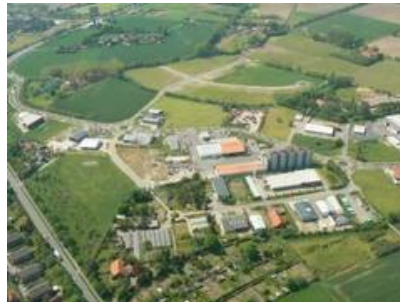
Luftbild Gewerbeparks Kiebitzpohl.JPG