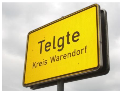
Telgte im Kreis Warendorf.JPG