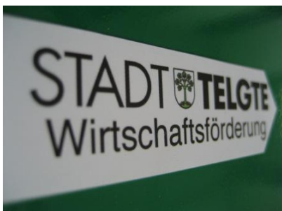
Wir freuen uns über Ihren Anruf 02504 13298.JPG