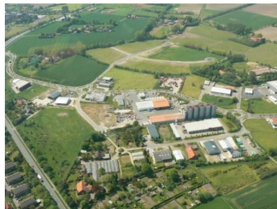
Luftbild Gewerbeparks Kiebitzpohl.JPG