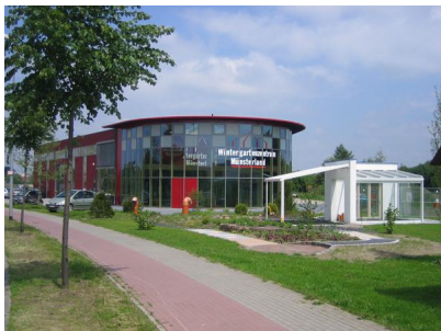
Einfahrtsituation Gewerbeparks Kiebitzpohl.JPG