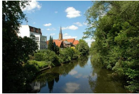
Lebnswerte Stadt - Emsblick.JPG