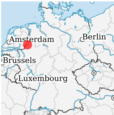
Location in germany