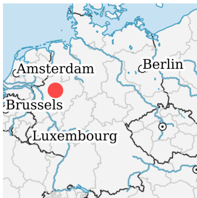
Location in germany