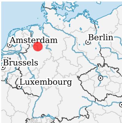
Location in germany