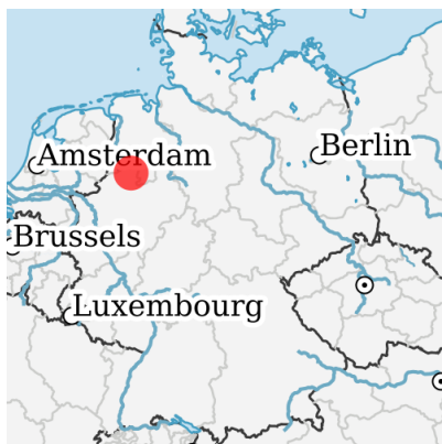
Location in germany