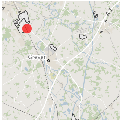
Location in municipality