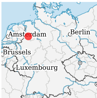
Location in germany