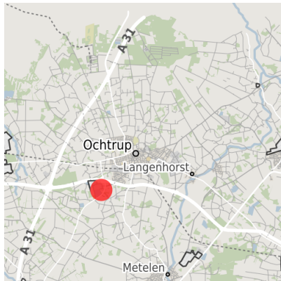
Location in municipality