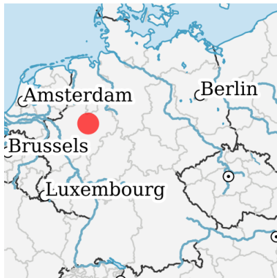
Location in germany