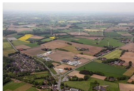
Luftbildansicht Gewerbegebiet Holtwick