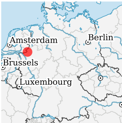
Location in germany