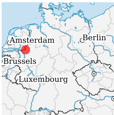
Location in germany