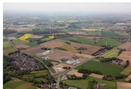
Luftbildansicht Gewerbegebiet Holtwick