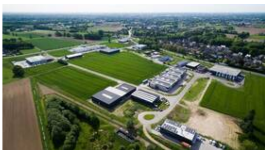
Luftbildansicht Gewerbegebiet Holtwick